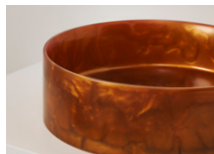
PEARL / COPPER