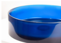
LIQUID / SAPPHIRE