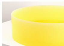
POWDER / LEMON