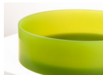
NATURE / RAINFOREST