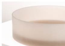
NATURE / STORM