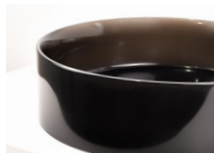
LIQUID / BLACK PEARL