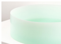
POWDER / MINT