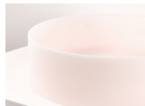
POWDER / SOFT PINK