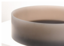
POWDER / PEWTER