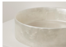
PEARL / ANTIQUE