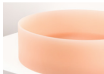
POWDER / CORAL