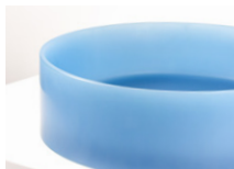
NATURE / OCEAN