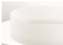
NATURE / MOONGLOW