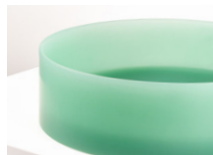
POWDER / FERN