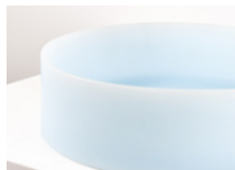
POWDER / POWDER BLUE