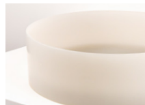
POWDER / DAPPLE