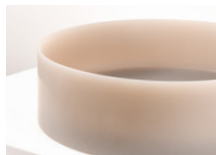
POWDER / SEAL