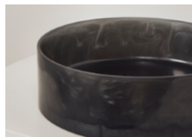
PEARL / ONYX