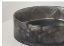
PEARL / OYSTER