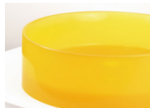
LIQUID / SUNSTONE