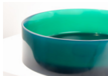
LIQUID / JADE