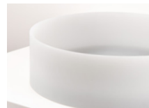
POWDER / FROST