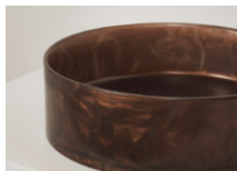
PEARL / COGNAC