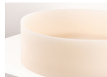
POWDER / STONE