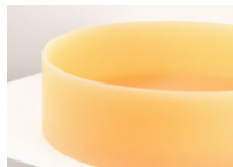
POWDER / MELON