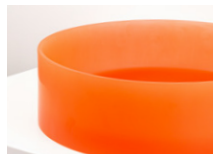
NATURE / ECLIPSE